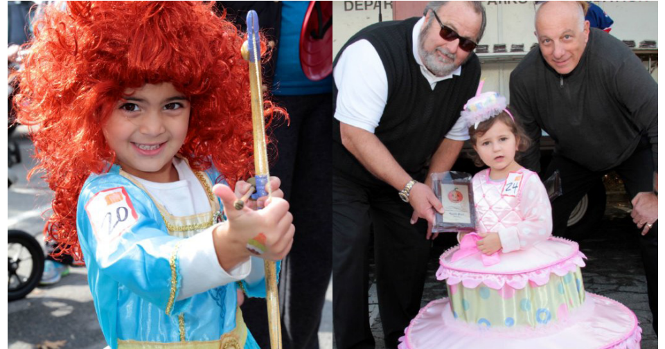
Gather the family for Rockville Centre's Annual Ragamuffin Parade and Party that will be held on Sunday, October 30th.

PLEASE NOTE DISPOSAL OF USED MEDICAL NEEDLES Used medical needles must be discarded at The Department of Health, any local hospital or nursing home. *DO NOT DISCARD USED NEEDLES IN HOUSEHOLD REFUSE