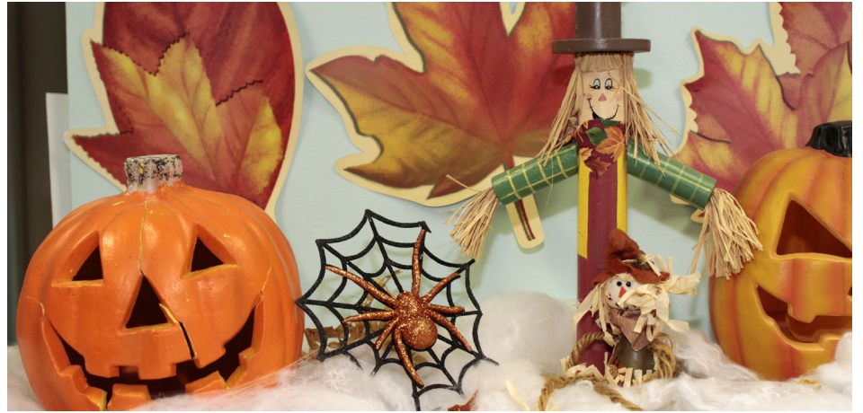
Join in the fall festivities at the annual Mural Painting Contest on Saturday, October 22nd.

DETAILED INFORMATION FOR ALL ACTIVITIES CAN BE FOUND AT THE RECREATION CENTER OFFICE OR ON THE RECREATION CENTER WEBSITE AT WWW.RVCREC.WEBLY.COM