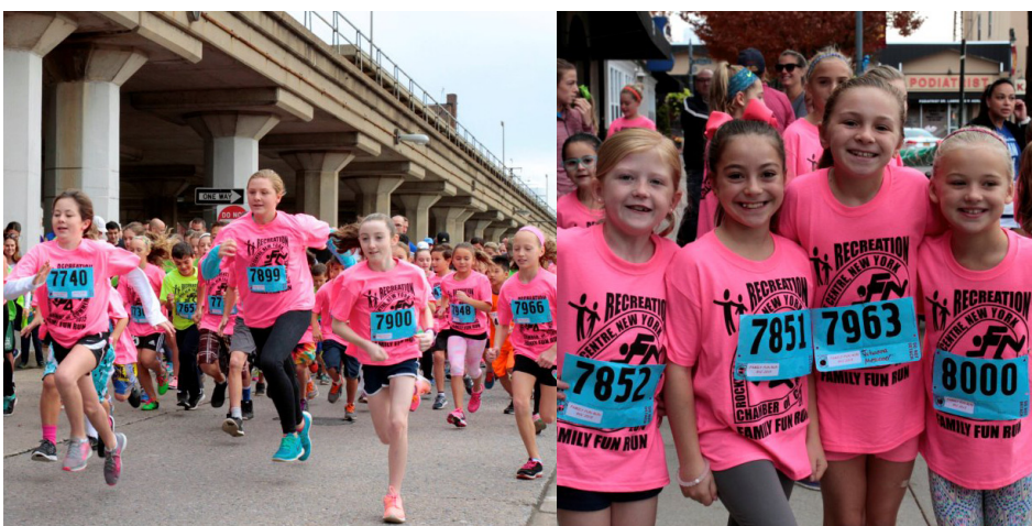
Lace up your shoes for the Village's annual 10K, 5K, and one-mile family fun run on Saturday, November 12th.

The station, on Sunrise Highway adjacent to the Public Works building, is open to the public the first and third Saturdays of the month from 10 a.m. to 2 p.m. until November 19th to receive large items of trash, including furniture and appliances. Proof of residency is required.